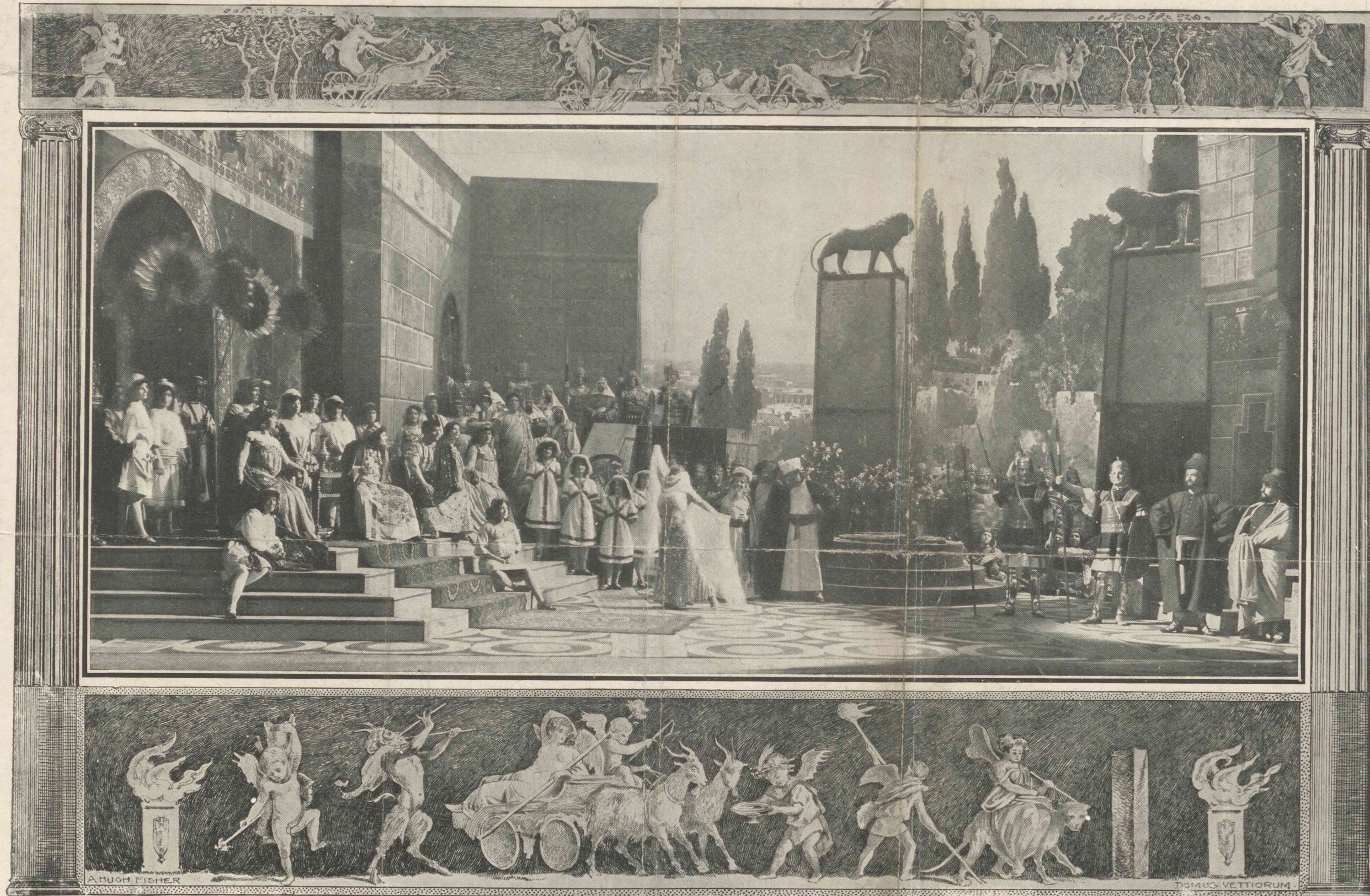
SALOME DANCING BEFORE HEROD: SCENE FROM THE PRODUCTION AT THE METROPOLITAN OPERA-HOUSE, NEW YORK.